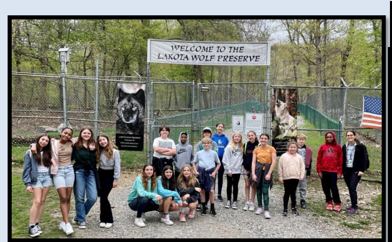
6<sup>th</sup> Grade Trip to Lakota Wolf Preserve