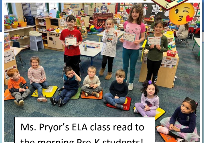
Ms. Pryor's ELA class read to the morning Pre-K students!