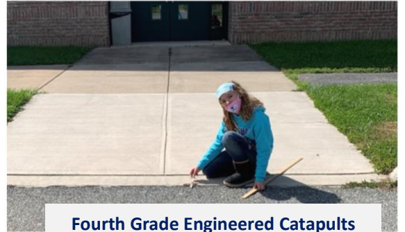
Fourth Grade Engineered Catapults and Launched Mini Marshmallows