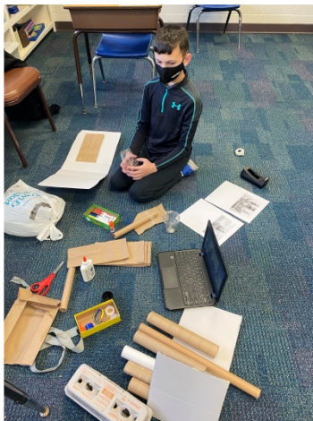
A Student is working on building The Mayflower in Social Studies