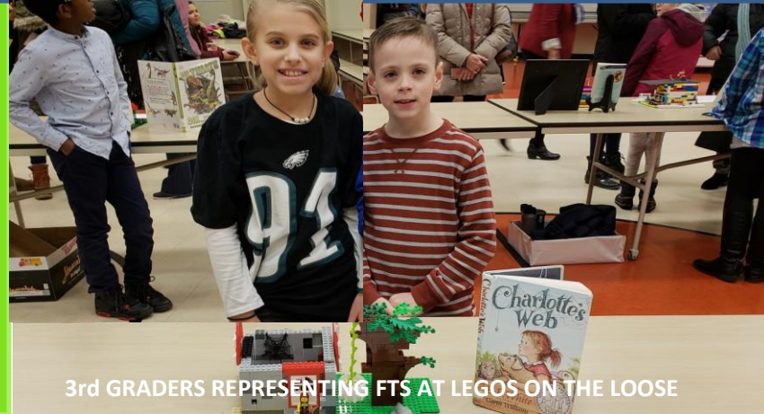
3rd GRADERS REPRESENTING FTS AT LEGOS ON THE LOOSE