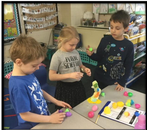
Kindergarten worked hard to stack plastic eggs in their stem challenge this week