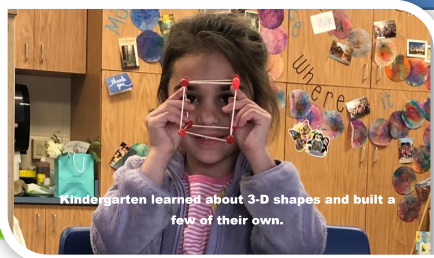
Kindergarten learned about 3-D shapes and built a few of their own.