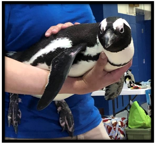
Betty the Penguin stopped by Frelinghuysen to visit with all of our students.