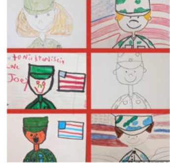
Third Grade Honored Our Veterans Thanking Them for Their Service