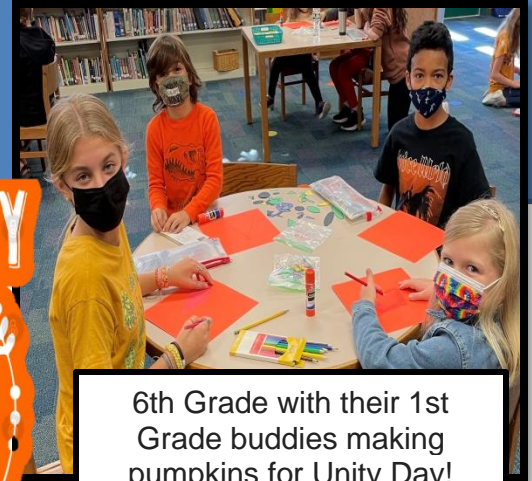
6th Grade with their 1st Grade buddies making pumpkins for Unity Day!

www.frelinghuysenschool.org October 18 th – October 22 nd